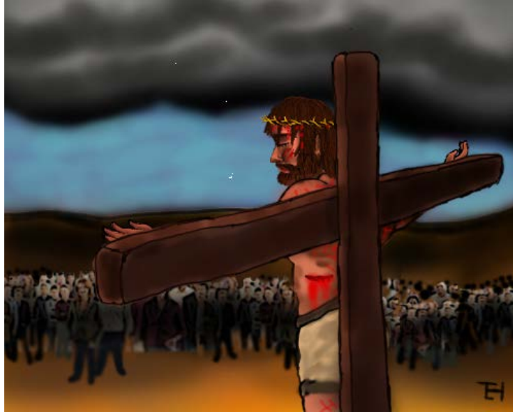
Christ died for sinners!

1 Johan 4:10 Sungsakunaw ci paw tuh: aenin nynh Pachia ah sungсах oh thualeite Amaw nynh oun sungсaza a Ccapaw oun shaw, tuh e tuh ah seinaw nгаeethyanaw elang nynh athua.