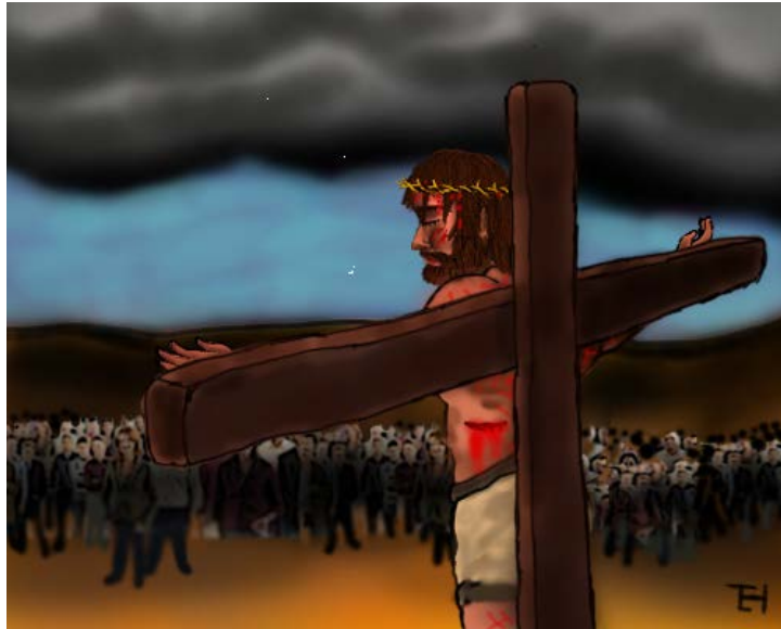
Christ died for sinners!

1 Johan 4:10 lithnaak kin ti hnaak khiah kin te ai Pathian kin iit hnaak ilo ii, amah sawn in kin iit ai, kin sual kin ngaithiam tuh in a Fapa a hlat hnaak ii.