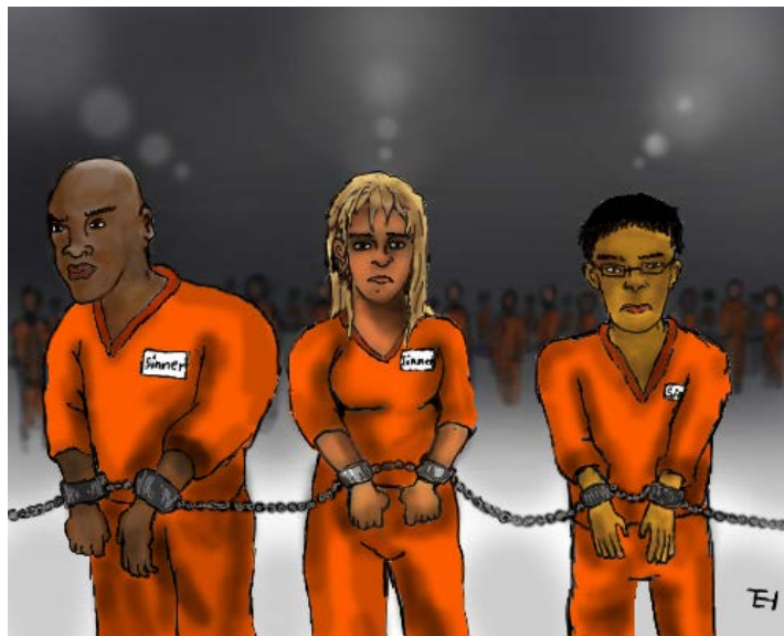
We are all sinners!

1 Johan 3:6 Cucaah Khrih chungah a ummi paoh cu sualnak chungah khan an um peng lo; sihmanhsehlaw sualnak a tuah pengmi nih cun Khrih kha a hmuh zong an hmu bal lo i a hngalh zong an hngal bal lo.