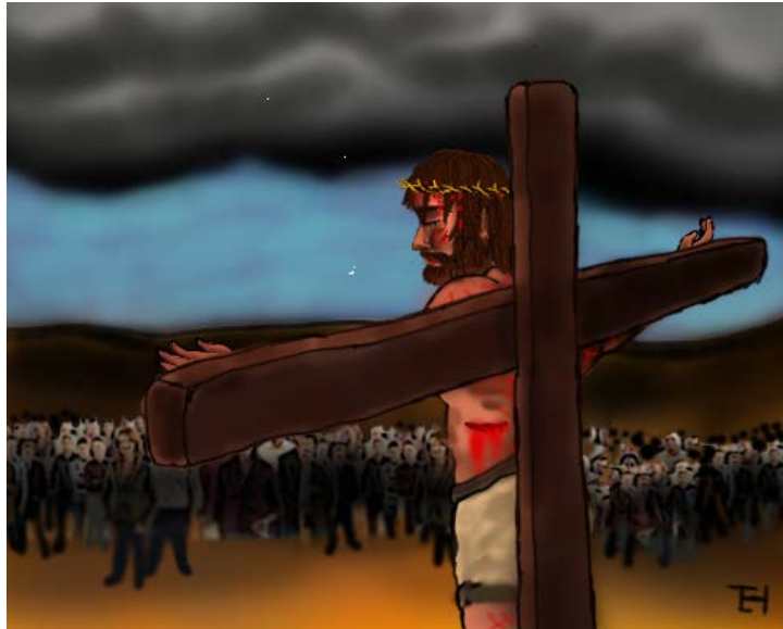
Christ died for sinners!

I Johan 4:10 Hi duhdawtnak ah Pathian kan duh si lo-in, Amah in in duhdawtih kan sual thuphacawinak *dingah A Fapa A run tirh.